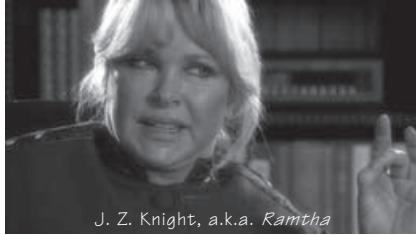
J. Z. Knight, a.k.a. Ramtha

to stop them when they tempt us to do things which aren’t socially acceptable, seemed to arbitrarily place more value on certain behaviors when, in fact, there shouldn’t be a problem with whatever one’s hormones choose. Or with whatever happens. Which seemed inconsistent, but they didn’t notice. It made me a little crazy.