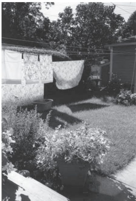
Back Yard view from Toad Hall