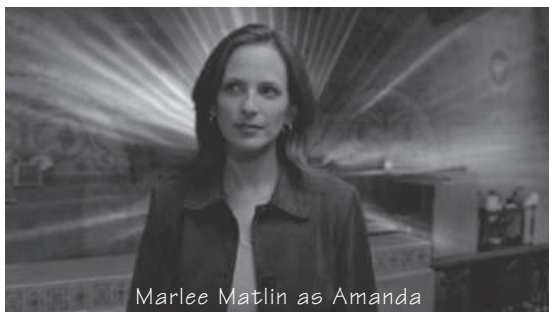
Marlee Matlin as Amanda

we do a little rock-climbing and see what happens?” I love his armor-bearer’s response: “I’m with you heart and soul!” No military strategist would have predicted the resulting disaster for the Philistines. That’s reality in every dimension, including quantum mechanics: God controls the universe. He’s also pleased to use people who aren’t power brokers in any way – which means I’m a player. The gospel’s power to save doesn’t depend on my comprehension of physics or neopaganism. I can show up with my heart and soul even when it’s a risky, blundering piece of rock-climbing.